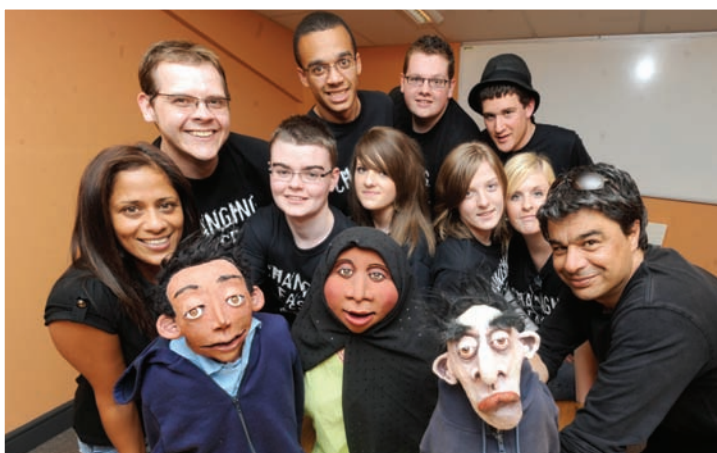
Changing Faces team with puppets that feature in the learning resource

The Changing Faces project produced the Preventing Violent Extremism teaching pack which is available to download through the Bread & Butter website – www.gmpa.gov.uk/breadandbutter