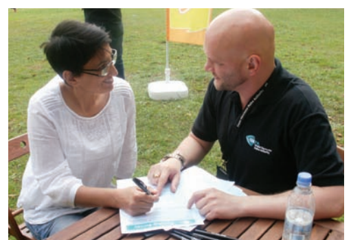
Consulting with members of the public

Now all the results are in, GMPA has analysed the information and made recommendations to Greater Manchester Police about what the public want from their neighbourhood policing teams.