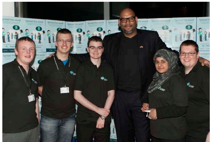
GMPA volunteers with John Amaechi (former NBA star)