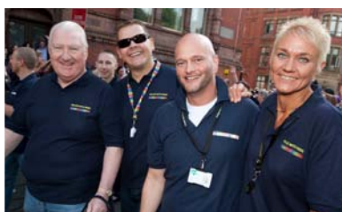
Engagement Team at Pride

We gathered down at Castlefield on Saturday morning for the Parade assembly alongside famous faces, including many of the cast of Coronation Street. As we waited for the Parade to begin, the clouds thickened and we were subject to a torrential downpour which saw all the flamboyant, costume-wearing, fur and feather flaunting semi-clad parade entrants running for cover. The stall holder selling transparent rain capes was the only one enjoying the rain! But, as we were signalled to line up for the start of the parade and the Police band struck up a tune, the clouds parted, the sun smiled down on us and promised not to 'rain on our Parade!'