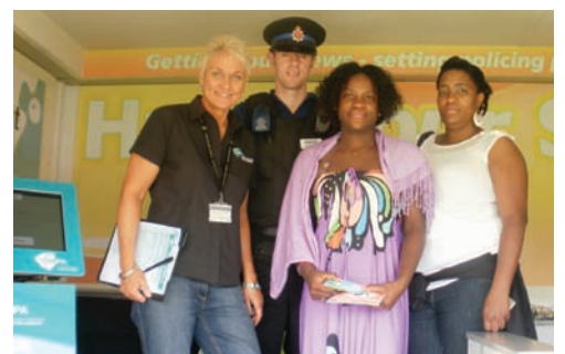
'Have Your Say' team on the van