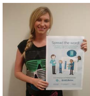
Brooke Kinsella (Eastenders actress)