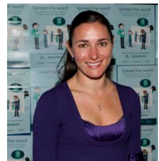
Sarah Storey (Paralympic Gold Medallist)