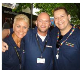
Engagement Team at Pride