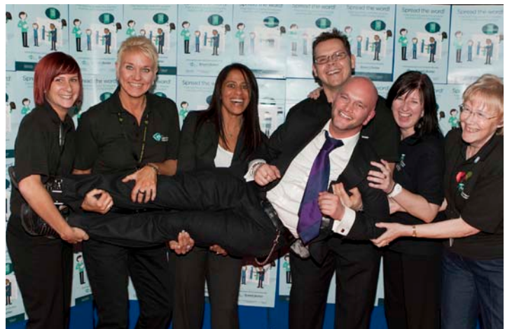
GMPA Engagement Team celebrating a successful launch

The free teaching packs are now available to download by registering your details at www.gmpa.gov.uk/breadandbutter